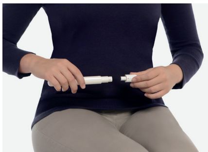
Remove the needle shield